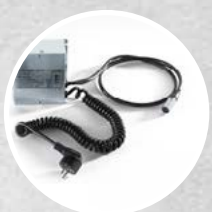
24V 5A CHARGER (for BC version) cod. 22.0619.00