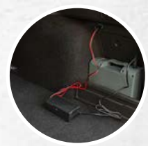
CAR CHARGER 24-12V 3A cod. 18.0065.00