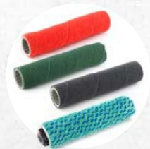
CYLINDRICAL PADS RED cod. 40.5000.12 GREEN cod. 40.5000.13 BLACK cod. 40.5000.14 MICROFIBER cod. 40.5000.04