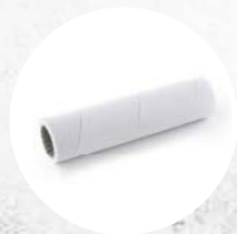
MELAMINE CYLINDRICAL PAD cod. 40.5000.10