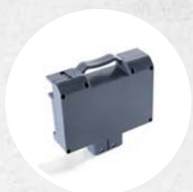
CASE BATTERIES LITHIUM 24V 280WH (for 10Ah version) cod. 22.0571.00