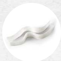
SET FRONT/REAR POLYURETHANE SQUEEGEE BLADE cod. 96.0084.00