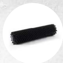
TYNEX CYLINDRICAL BRUSH GRIT 80 cod. 40.5000.08