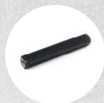
CYLINDRICAL PAD HOLDER cod. 40.5000.06