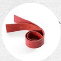
SET FRONT/REAR RUBBER SQUEEGEE BLADE cod. 96.0085.00