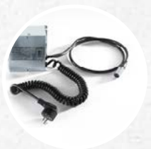
24V 10A CHARGER cod. 22.0619.01