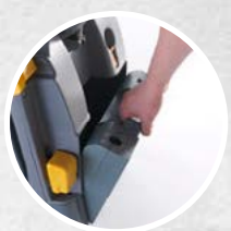
CASE BATTERIES LITHIUM 24V 560WH (for 20Ah version) cod. 22.0571.01