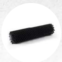
TYNEX CYLINDRICAL BRUSH GRIT 360 cod. 40.5000.03