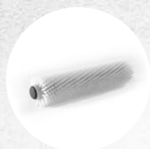
SOFT CYLINDRICAL POLYPROPYLENE BRUSH cod. 40.5000.01