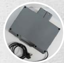
KIT CASE POWER SUPPLY 230V It allows to use battery models M33 as cable ones (standard for E models) cod. 22.0509.00