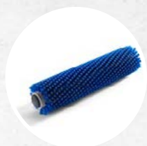
POLYPROPYLENE CYLINDRICAL BLUE BRUSH cod. 40.5000.00