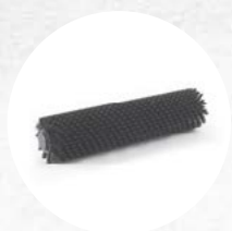
HARD CYLINDRICAL POLYPROPYLENE BRUSH cod. 40.5000.02